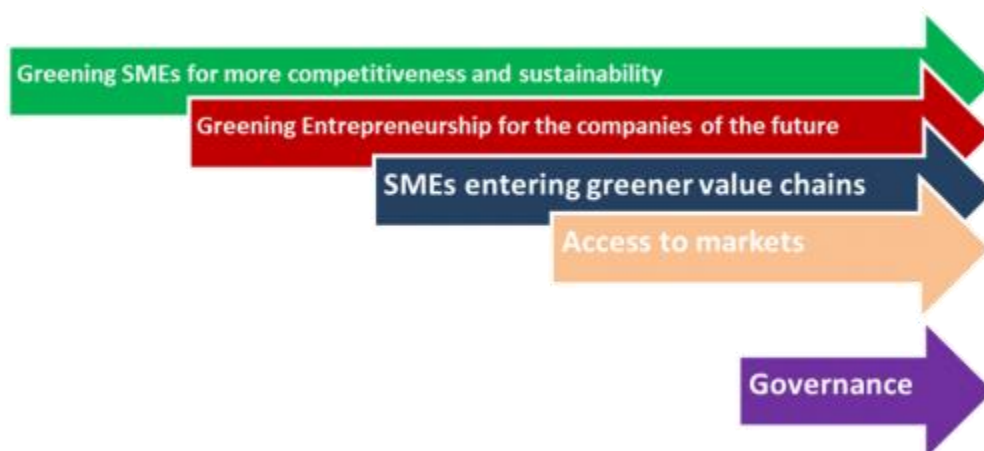
Fig.1: GAP Objectives for SMEs

Responding to that need the EU has established the Green Action Plan for SMEs that set out a series of objectives and corresponding actions, which can be grouped into the thematic areas shown in figure 1. The importance of this concept lies in the recognition that the many SMEs activities have to be seen as different manifestations of “a whole”, the entity of SMEs. This indicates that an integrated approach towards SMEs is required and thus accepted by the EU.